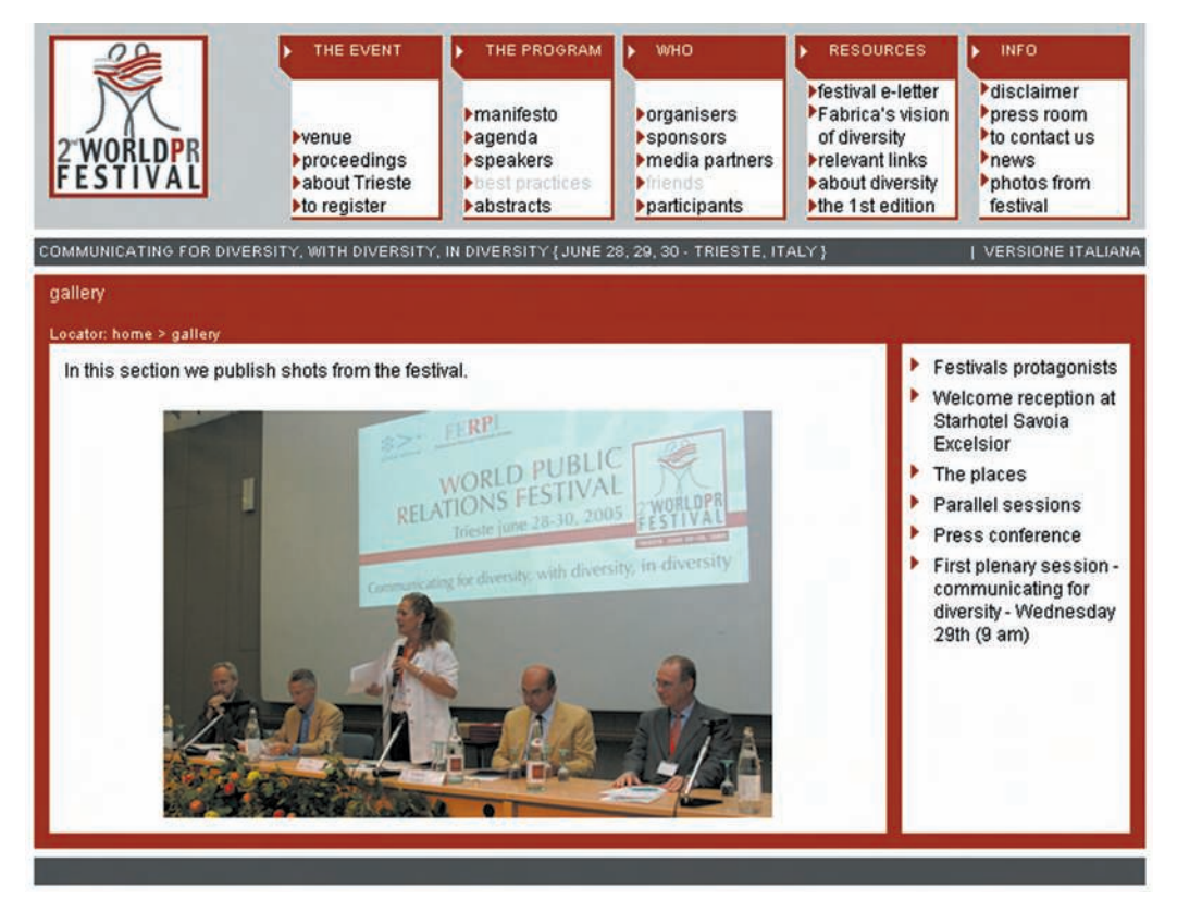
PICTURE 9.1 The World Public Relations Festival in 2005 made diversity its theme. Will public relations become more inclusive?